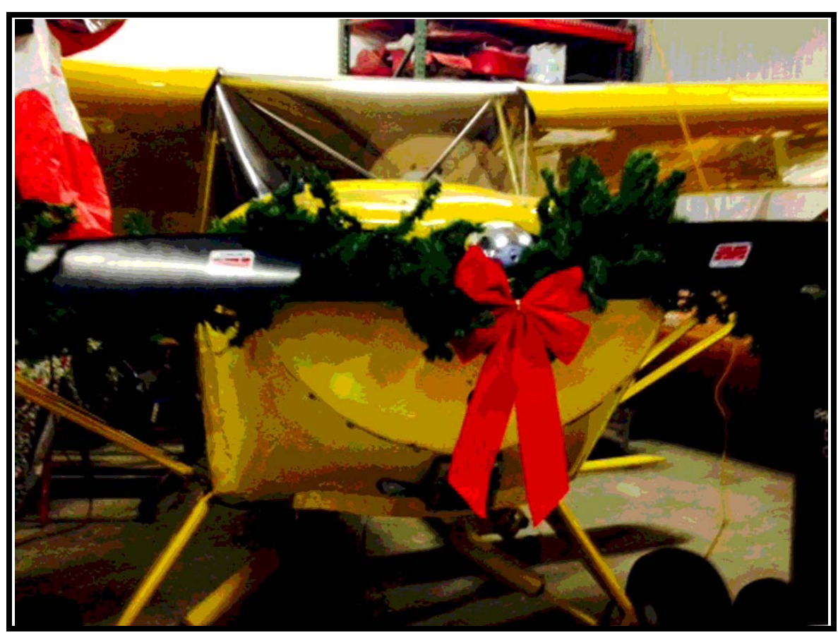
SONOMA SKYPARK/EAA CHAPTER 1268 CHRISTMAS PARTY It was great. What else can I say?