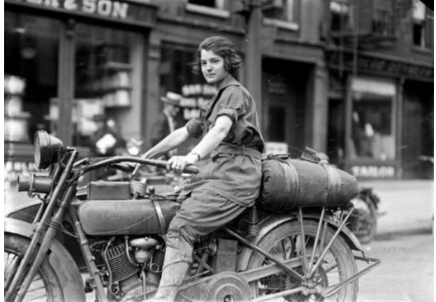
A Regular Feature of the Flying Times

Send me some photos of women in airplanes and I'll put them in also.