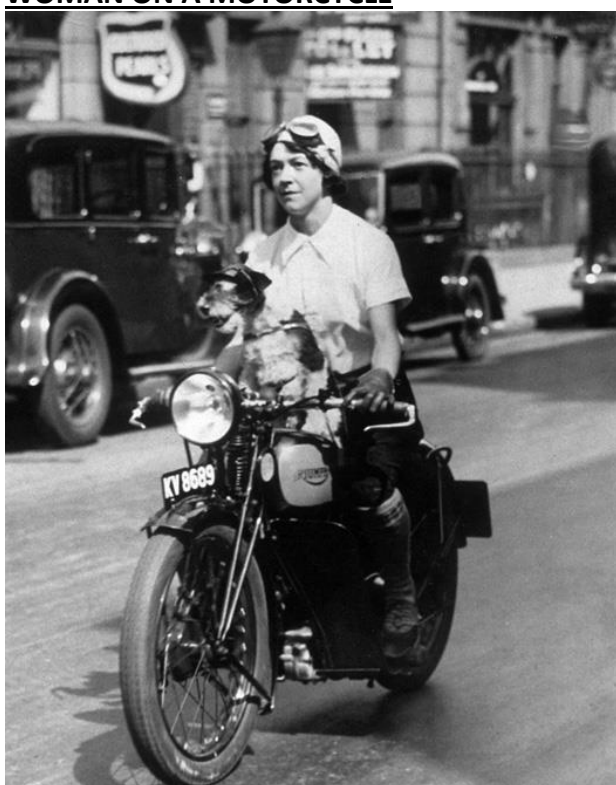
A Triumph is always a good ride. Especially with your dog.