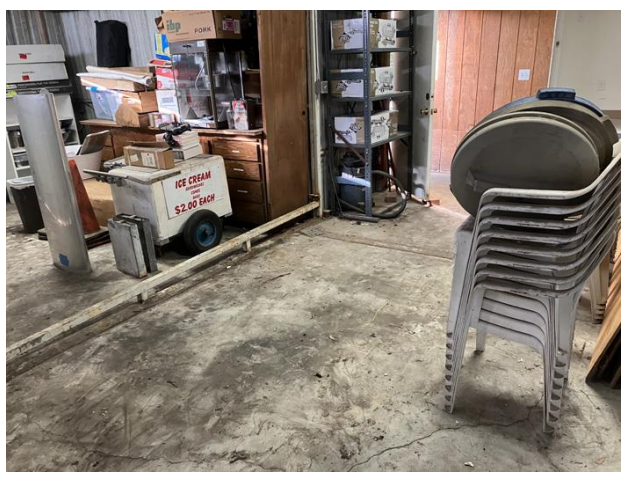
You can actually see the floor now. Please don't "donate" anything that's too valuable to throw away without checking first.

Every Saturday Noon to 1:30 pm Skypark Hamburgers and Hot Dogs in the clubhouse!