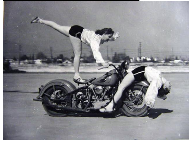
Something to brighten a rainy day.