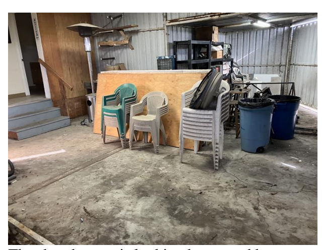
The shop hangar is looking better and better. We need a couple volunteers to put up some insulation on the kitchen ceiling.