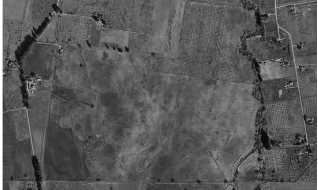
Phil Danskin sent me an aerial photo of Sonoma Skypark in 1948. Yeah...