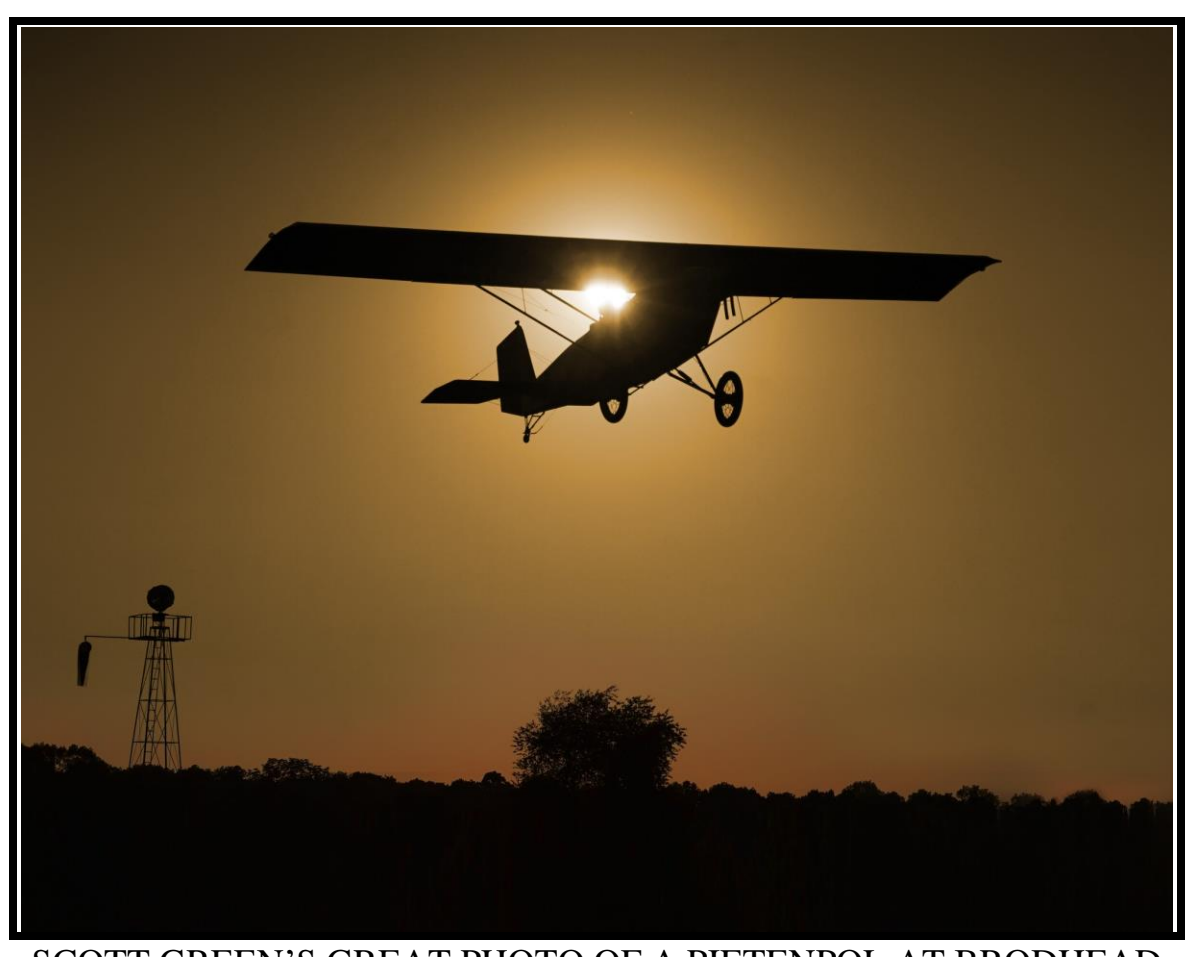
SCOTT GREEN'S GREAT PHOTO OF A PIETENPOL AT BRODHEAD The annual Brodhead Pietenpol fly-in is July 20-23. Don't miss it!