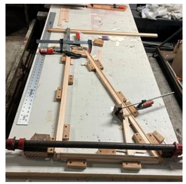
The vertical stabilizer going together in the Chapter workshop

The crew is starting with the vertical stabilizer to learn the construction skills and techniques necessary for building a wooden fuselage airplane.