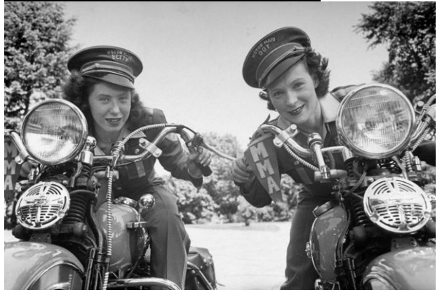
Not sure if I put these two in before, but they deserve another look.