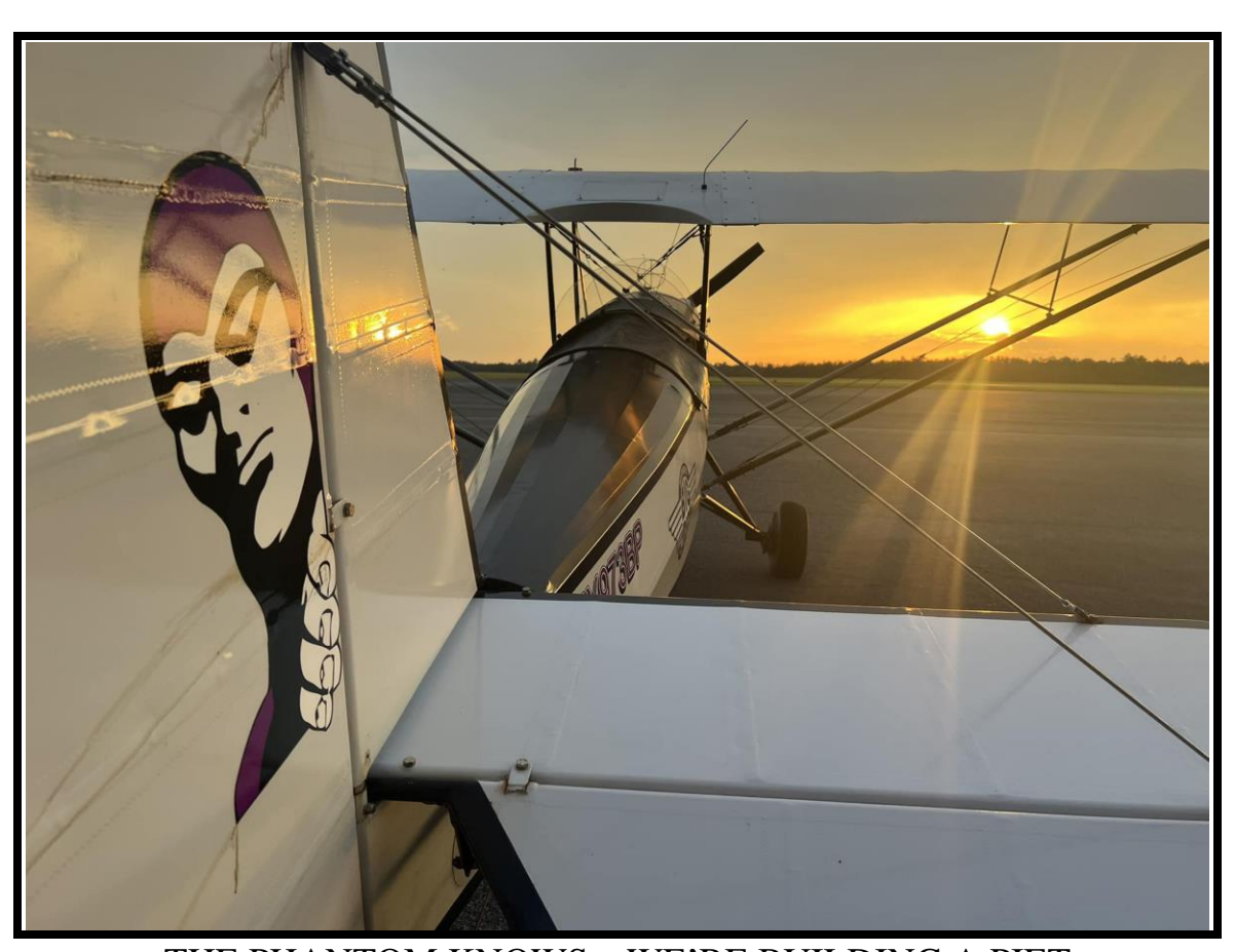
THE PHANTOM KNOWS...WE'RE BUILDING A PIET